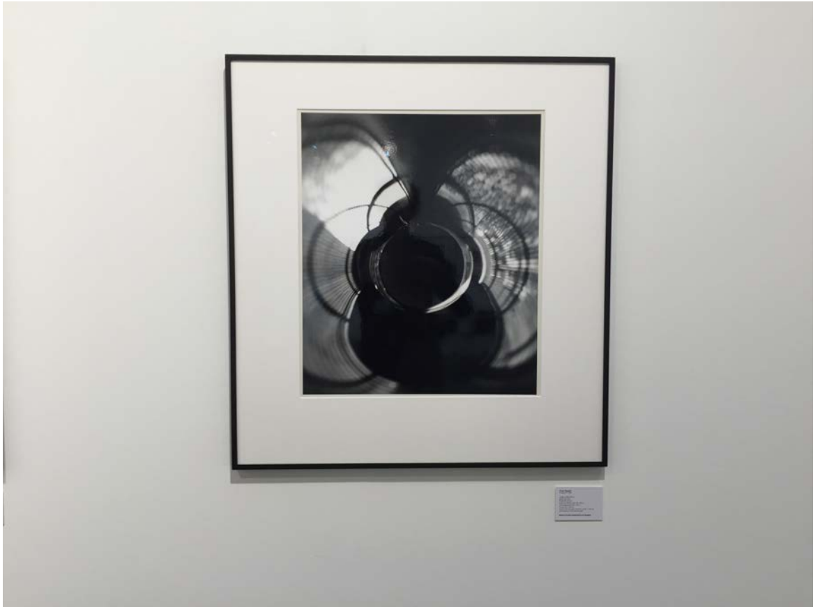
TIMM RAUTERT Fotogramm I, 1966 vintage on Agfa-Brovira gelatin silver print 59 x 50,2 cm