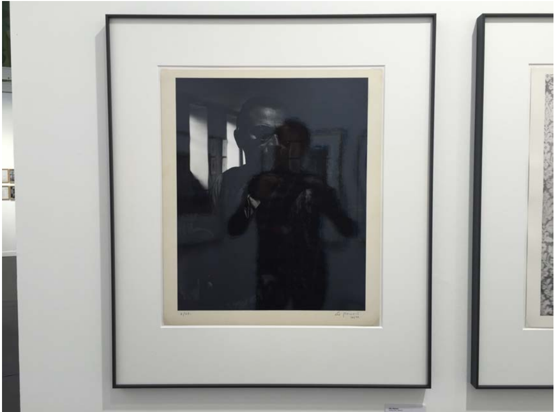
OTTO STEINERT Selbstportrait, 1956/57 vintage on Agfa-Brovira gelatin silver print 58,9 x 47,8 cm